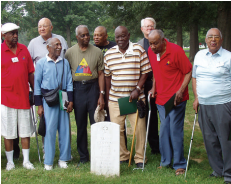
JUST BEFORE THE MEMORIAL SERVICE AT COL BATES' GRAVESITE

"56 YEARS AGO THE MEN IN THIS BATTALION WERE SHAKING UP THE EUROPEAN BATTLEFIELDS IN WORLD WAR II"