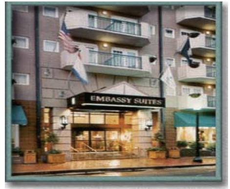
THE EMBASSY SUITES HOTEL NEW ORLEANS ARTS AND WAREHOUSE DISTRICT

After a long day of meetings and/or recreation, join your friends any (or every) evening for a two hour complementary managerial reception with premium brand cocktails, wine, beer and snacks either in Madeleine's Bar overlooking the atrium or in the Lofts main lobby. Relax, renew old friendships and explore new ones.