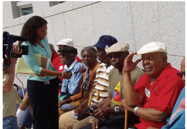
THE NEWS STORY CAN STILL BE VIEWED VIA THE INTERNET AT WWW.WUSATV9.COM . GO TO THE STATIONS WEBSITE AND SEARCH ON 761ST TO SEE THE VIDEO AND READ THE TEXT WRITTEN BY DEREK MCGINTY.