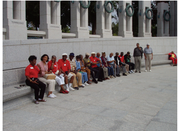
THE WORLD WAR II MEMORIAL LAYS BETWEEN THE LINCOLN MEMORIAL AND THE WASHINGTON MONUMENT. CONSTRUCTION BEGAN IN SEPTEMBER 2001 AND OPENED TO THE PUBLIC ON APRIL 29, 2004. IT WAS DEDICATED SATURDAY MAY 29, 2004

The 761st Tank Battalion and Allied Veterans Association celebrates and preserves the tremendous contributions African American soldiers played in securing our nation's liberty, including awarding education scholarships to deserving high school graduates, establishing a national monument at Fort Hood, Texas, and getting these untold chapters into America's history books.